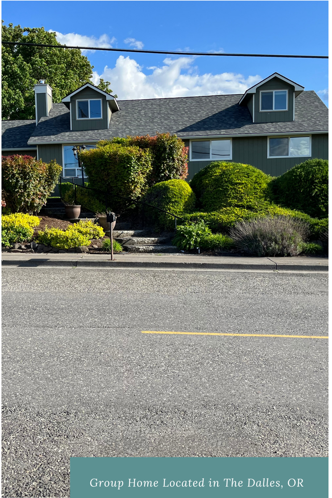
Group Home Located in The Dalles, OR